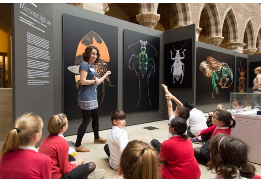
Image: Delivery of a special Microsculpture primary school session

The success of the Visions of Nature year has encouraged the Museum to start commissioning contemporary art through an open call, to sit alongside the Contemporary Science and Society exhibition series. In addition, a new community display case has been installed since Visions of Nature to showcase the creative work of some of the community groups the Museum works with. Exhibitions have included a display of creative writing and artwork by local primary school children who have communication difficulties. The work was created in response to a number of specially designed sessions delivered in the Museums.